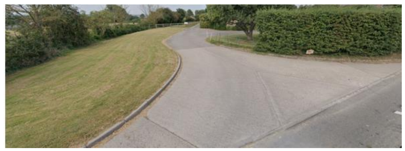
Google Street view image of the access to the application site from Whaddon Lane

There is only one residential property within the immediate vicinity of the application site, at Knoll Farm, where the boundary is approximately 50 metres away from the boiler, but its residential curtilage (shown in yellow on the previous page) is considered to be approximately 110 metres away. There are also a further three dwellings approximately 190 metres (and beyond) to the south east of Bekson Farm.