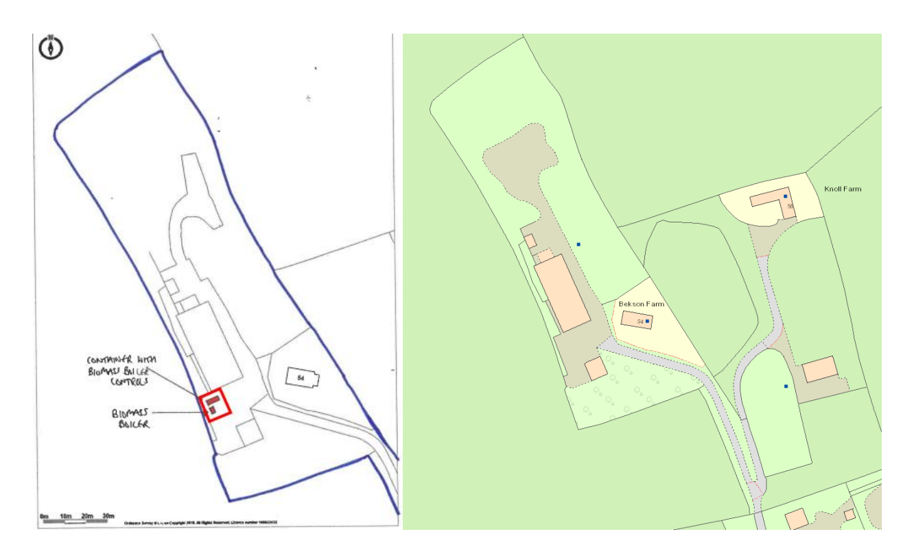
Site Location plan and Council mapping image of Bekson Farm and Knoll Farm