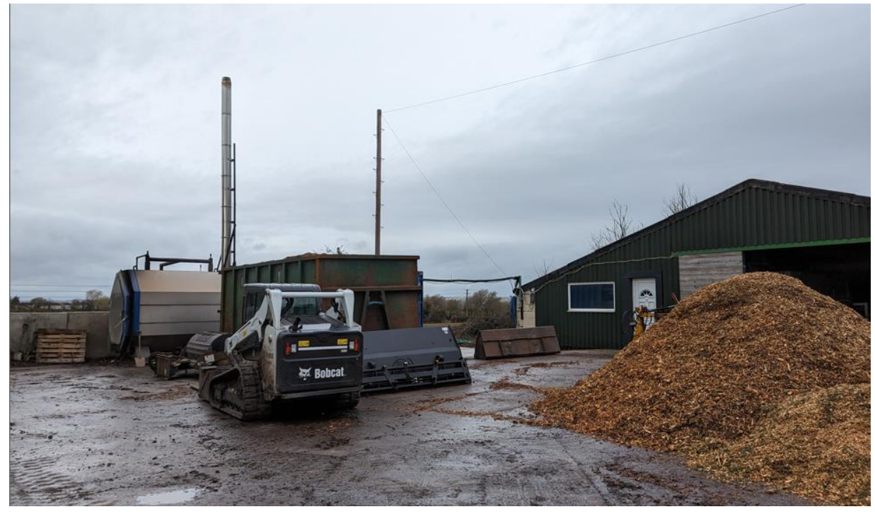
Photo taken on site of the boiler with the recently installed 6m high flue (and control room) and drying containers with the former piggery on the right

Photo taken on site of the boiler (and control room) and drying containers with two existing agricultural buildings either side – with 4m high flue (summer of 2022)